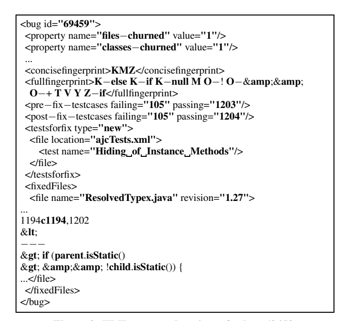
Figure 3: XML content descriptor for bug 69459.

The publicly available Subject-Artifact Infrastructure Repository ( SIR ) provides six JAVA and thirteen C-programs [4]. Each program comes in several different versions together with a set of known bugs and a test suite. There are two drawbacks of SIR: First, most projects are rather small, the average project size is only 11 kLOC. Second, almost all bugs are artificially seeded; however, realistic bugs are likely to be different. With iBUGS, we will provide SIR with subjects that come with a large number of realistic bugs.