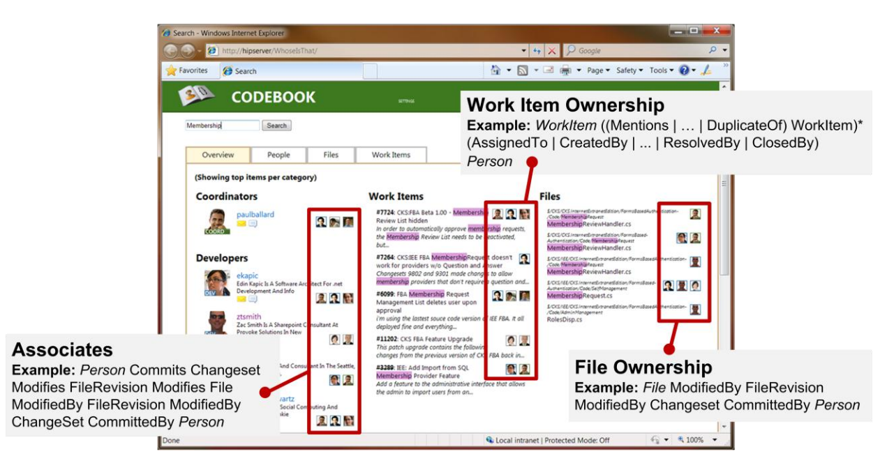
Figure 2. Screenshot of WhoseIsThat search results. Each column shows a different type of result, from left to right: people, work items, and files. Small photos next to each result show the associates for people or owners for artifacts. The screenshot is annotated with the regular expressions used to find associates and artifact owners.